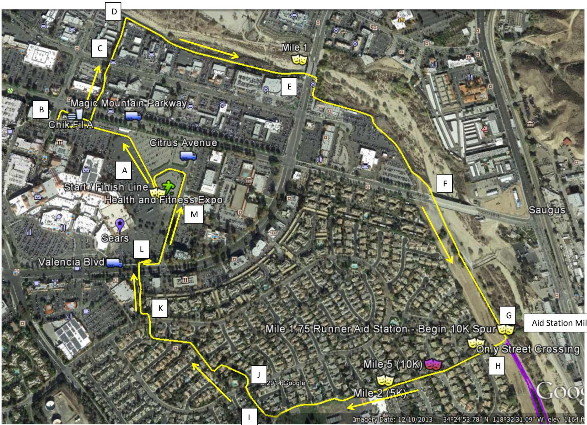
Mardi Gras Madness 5K/10K Final Course Layout (5K)